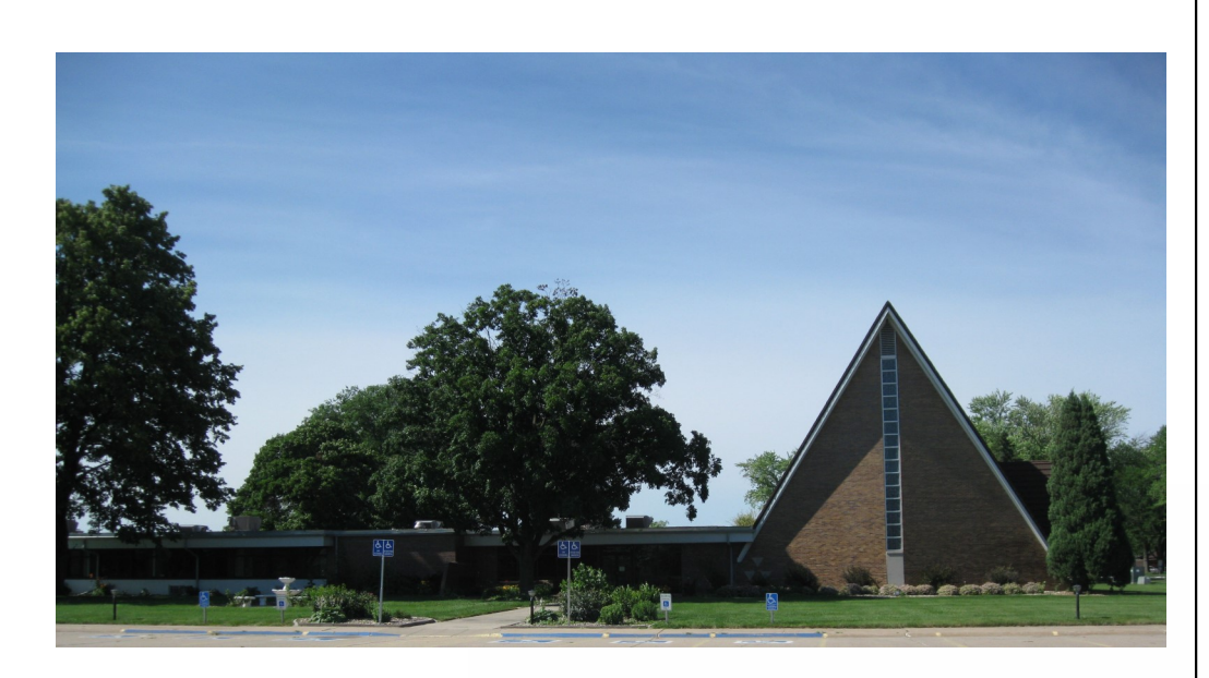
God's Work. Our Hands.